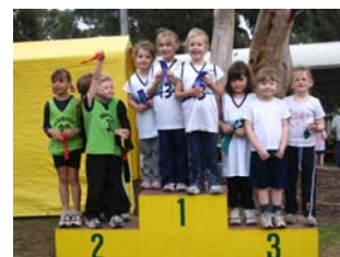
PROUD AS PUNCH! Our U6 girls taking 1st & 3rd place in the teams.