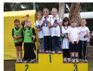
PROUD AS PUNCH! Our U6 girls taking 1st & 3rd place in the teams.